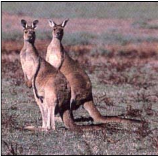
Figure 1 Western Grey Kangaroo ( Macropus fuliginosus ) (Photo: Bert & Babs Wells / DEC).

Western grey kangaroos are large marsupials that are 97-223 centimetres from head to tail and three to 70 kilograms in weight (females weigh up to 34 kilograms). Although called grey kangaroos, they are light grey-brown to chocolate in colour with paler undersides (Figure 1). Western grey kangaroos sometimes have white marks on the forehead and, unlike other kangaroos, the muzzle is finely haired. Males have a strong, characteristic odour and well-muscled shoulders and forearms.