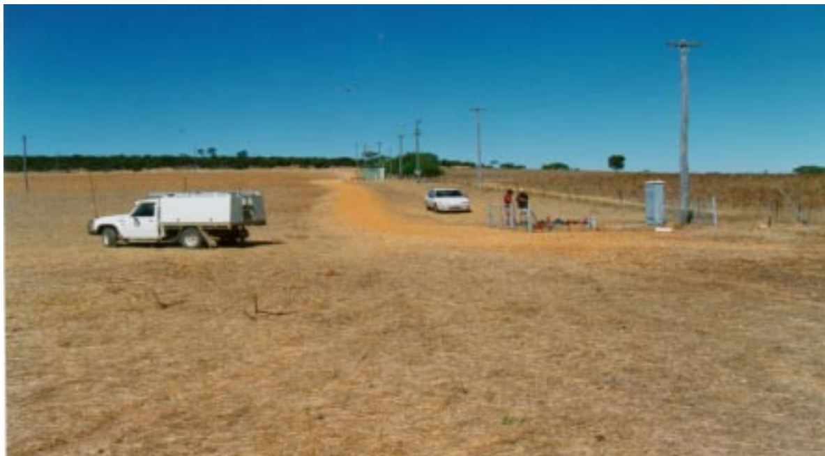
Plate 1. Bore 2/67.

The aquifer is shallow and unconfined, and therefore considered vulnerable to contamination.