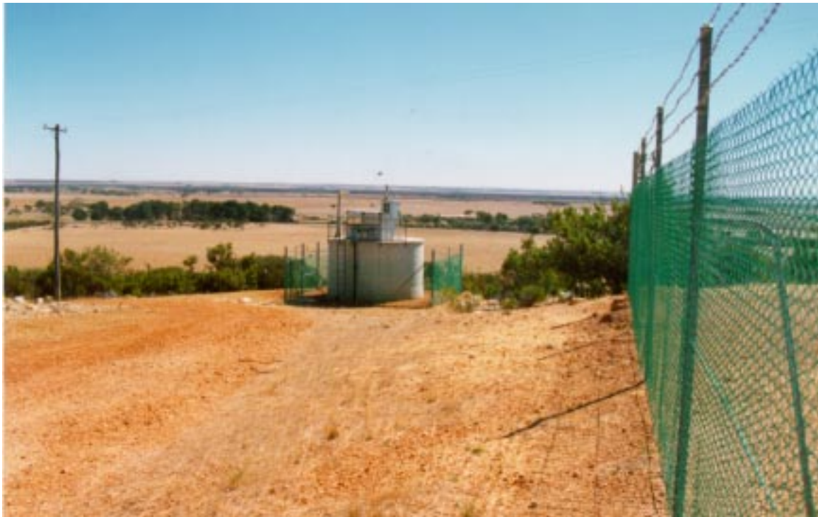
Plate 2. Water pumped from the wellfield is directed to two storage tanks via a treatment plant.

The results of major component analyses of the water in production wells meet the current Australian drinking water guidelines (NH&MRC and ARMCANZ, 1996).