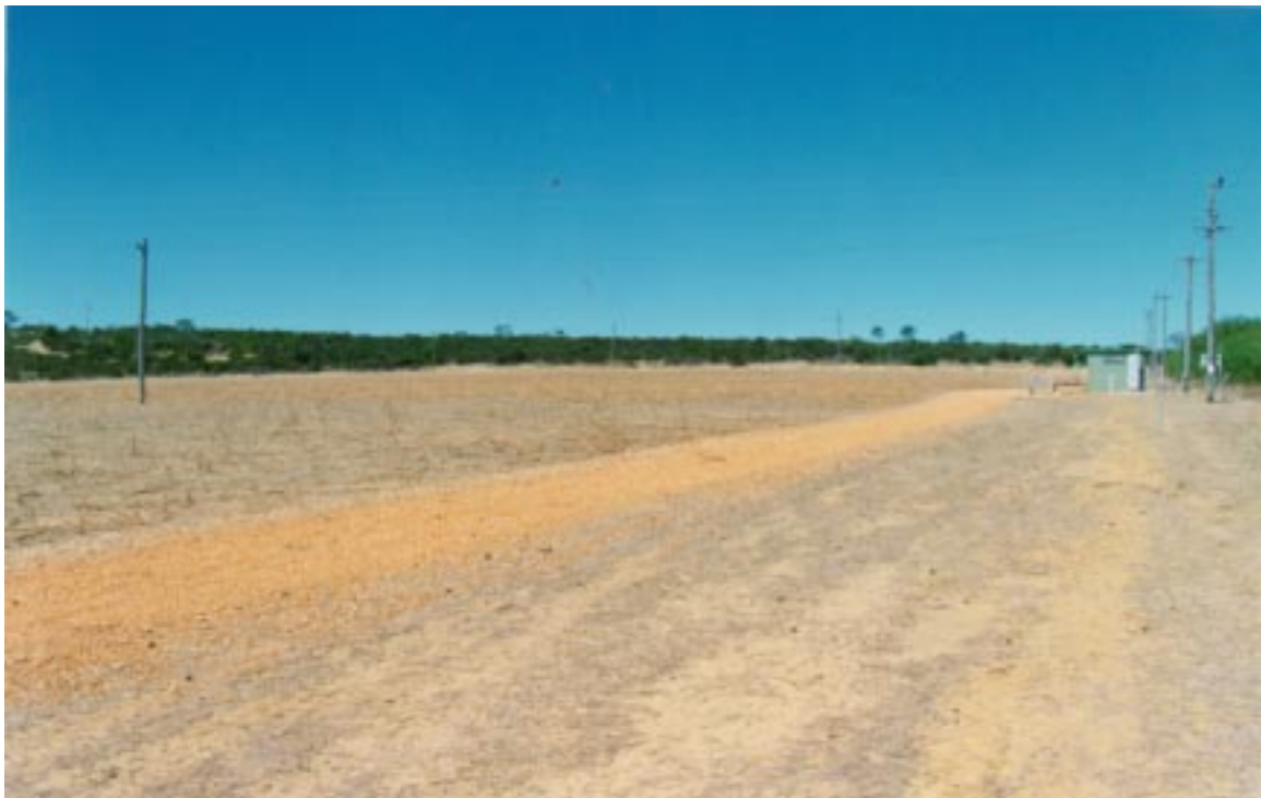
Plate 3. The Coomberdale wellfield is located on agricultural land and more intensive development could lead to degradation of the groundwater quality.

A circular wellhead protection zone of 300 m radius centred on each bore should secure the immediate wellfield.