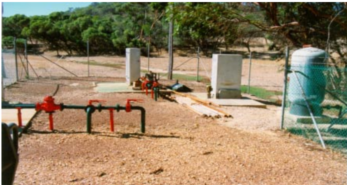
Plate 1. Bores 3/63 and 5/78.

The aquifer is shallow and unconfined, therefore, vulnerable to contamination.