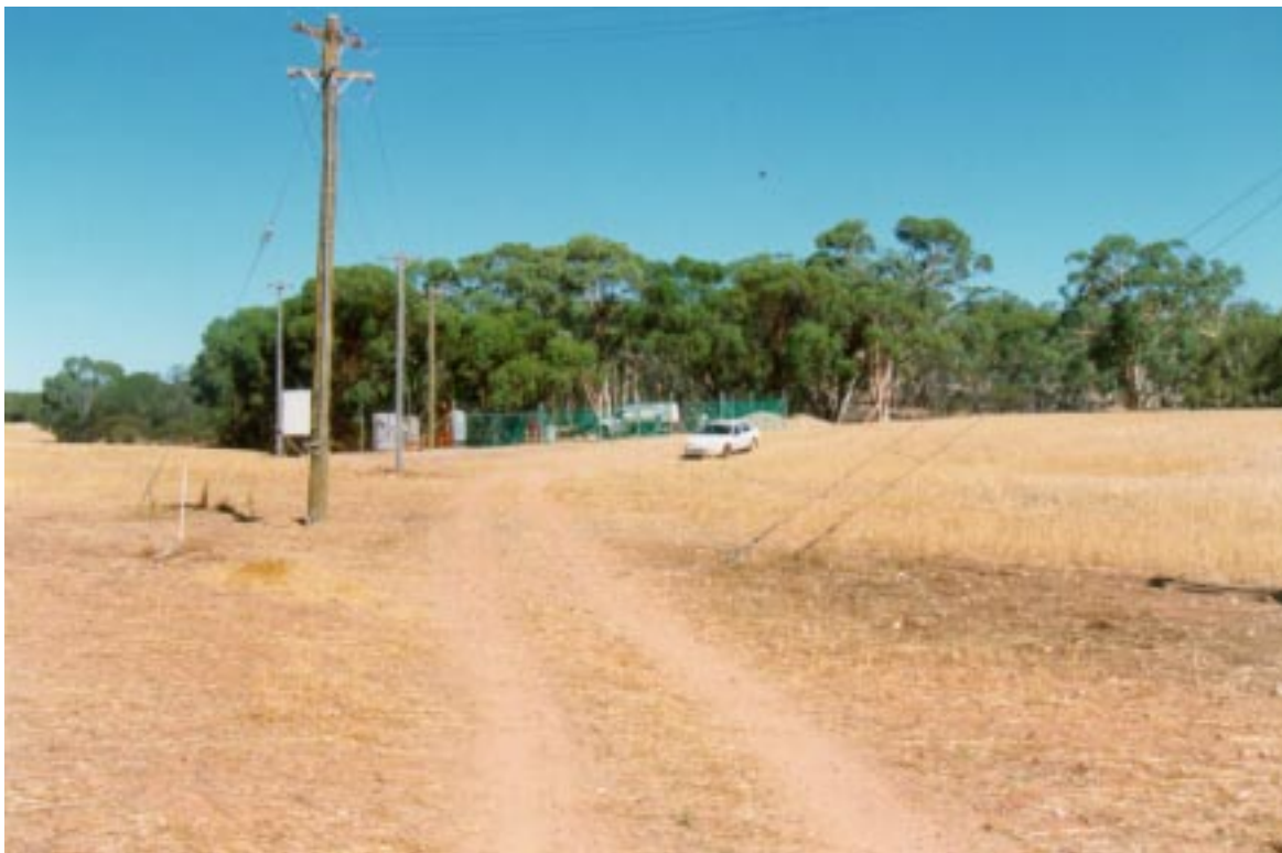
Plate 2. The Watheroo wellfield is located on the privately owned Wrara Station.

The potential for contamination of the groundwater from land use within the proposed reserve is low. The risks associated with the extensive agricultural land use (Figure 2) are considered acceptable for the proposed priority 2 classification of the wellfield.