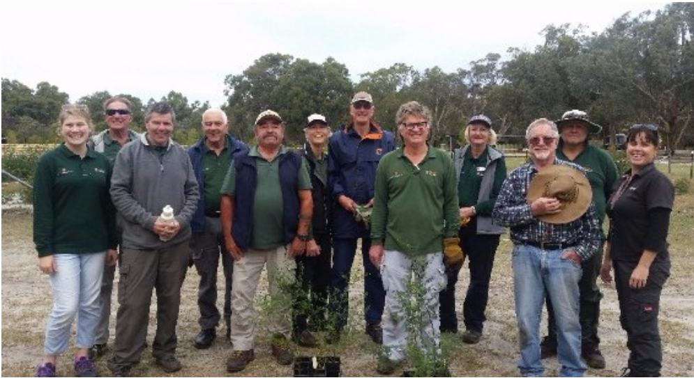
Some of the wonderful volunteers at Yanchep National Park

and privacy for campers, as well as habitat for native animal species.