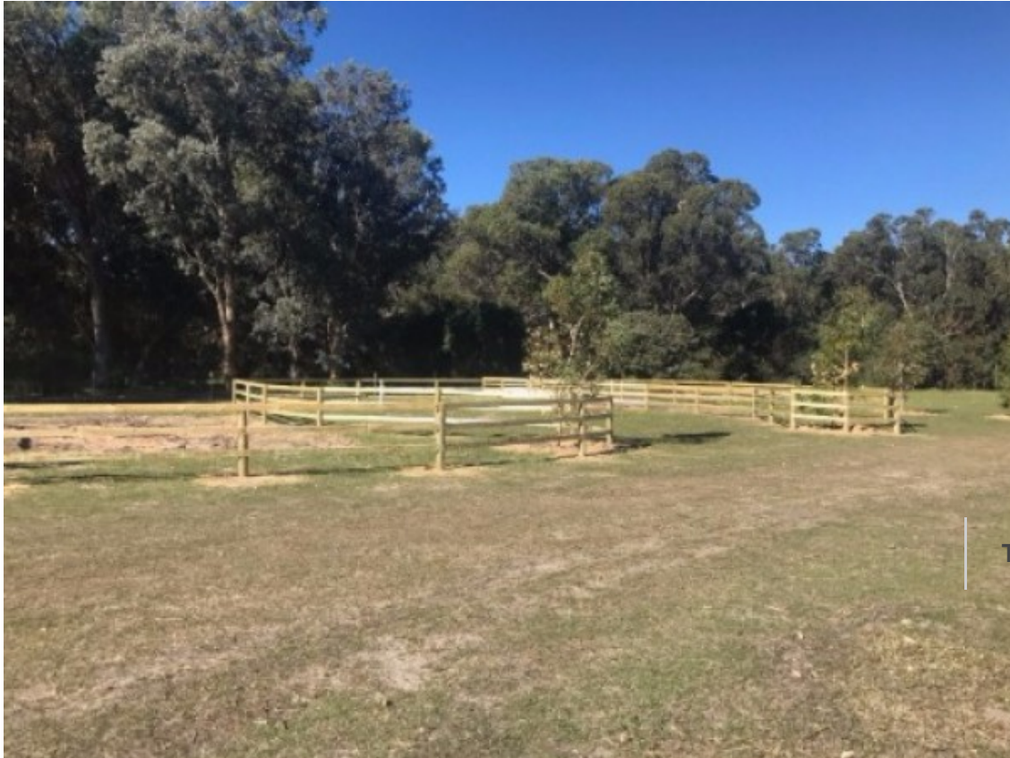
Camping pod at Yanchep National Park

Park manager Julia Coggins said campground improvements to date included the installation of an effluent dump point, building of fences, designation of individual site pods and planting of trees, shrubs and other vegetation which will grow to provide much-needed shade and natural pod boundaries.