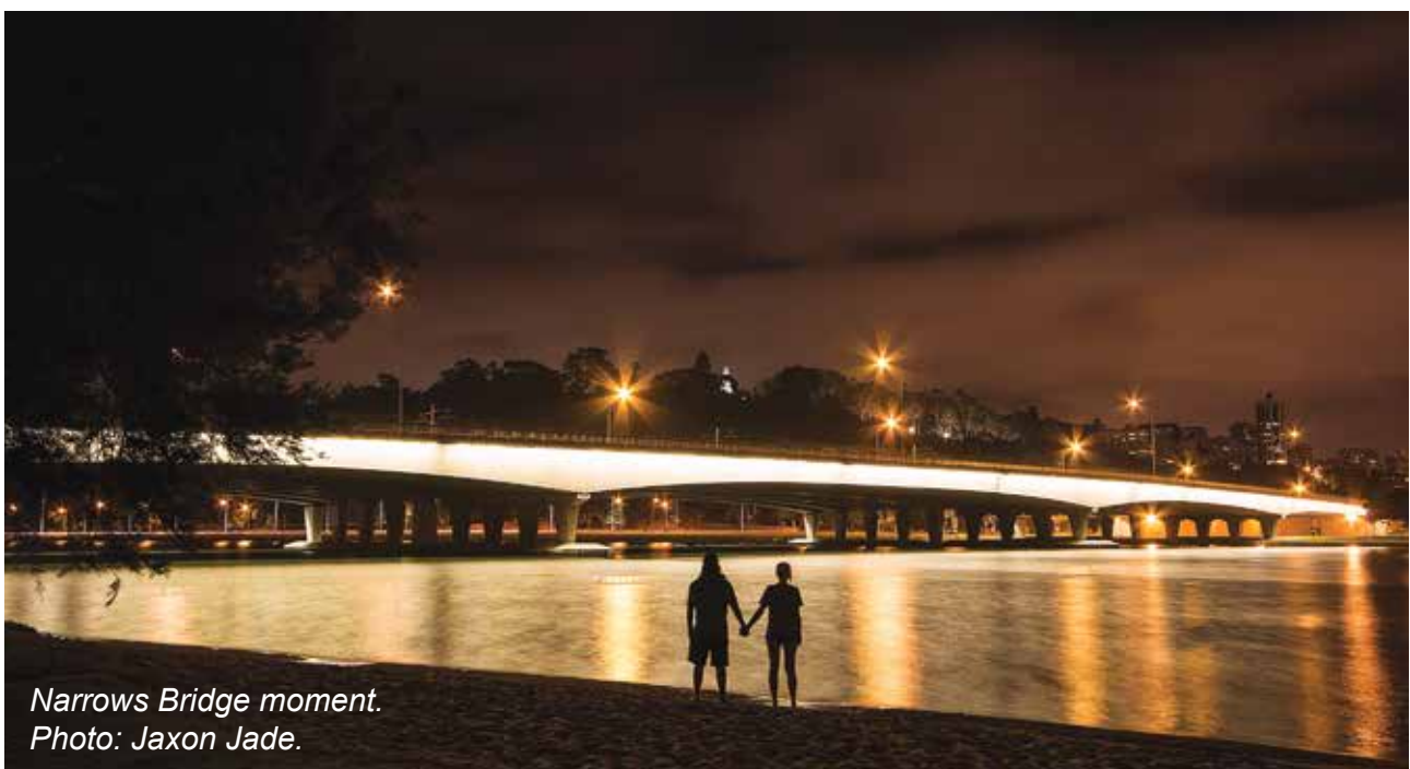
Narrows Bridge moment.

When a representative of the MRA or local government attends a meeting for this purpose, they have all the functions of a Trust member in considering the particular matter. Where it is considered appropriate, the Trust also invites persons with an interest in matters to attend meetings including proponents of development applications, representatives of peak bodies with an interest in the Swan Canning Riverpark and resource management.