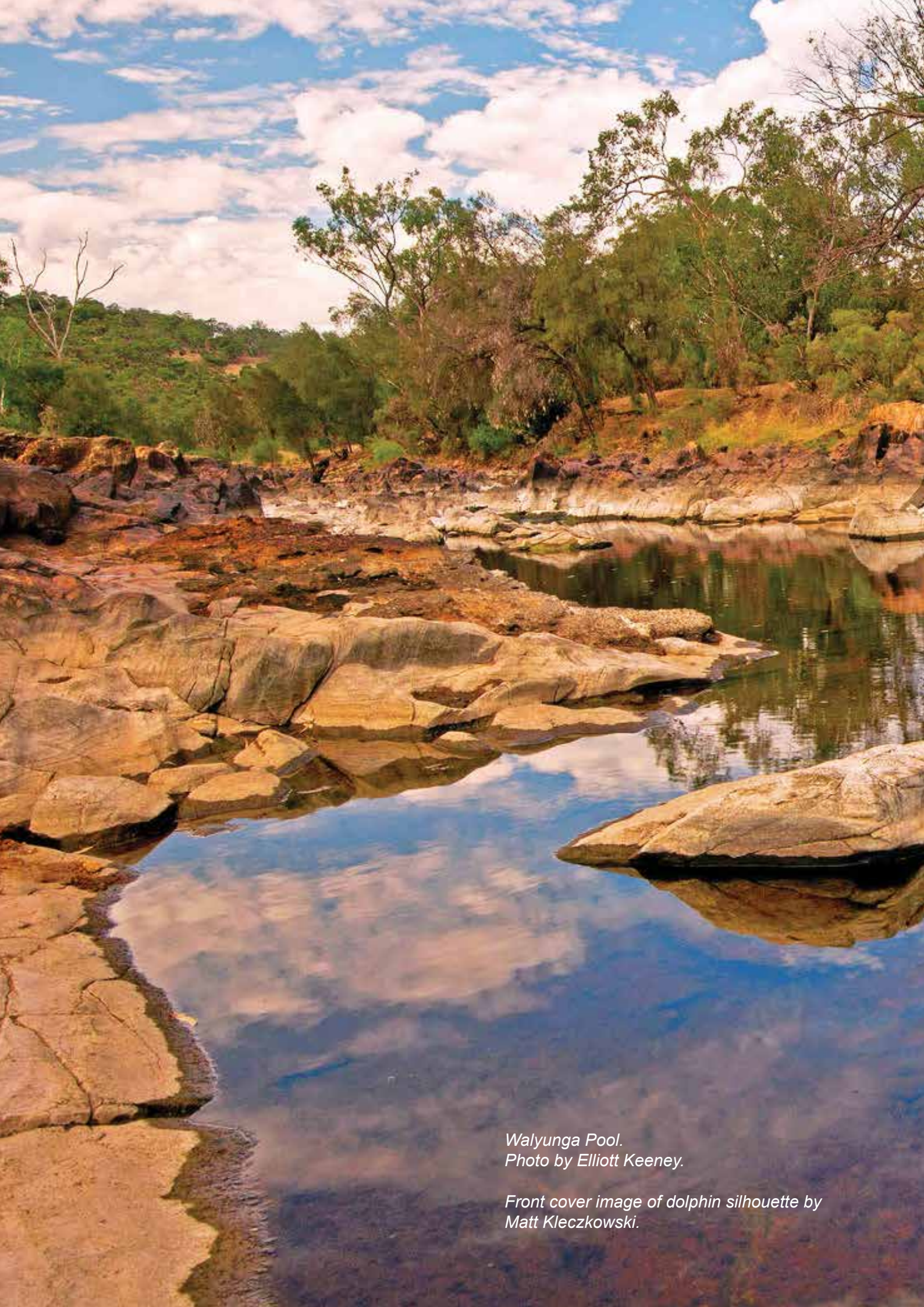
Walyunga Pool.