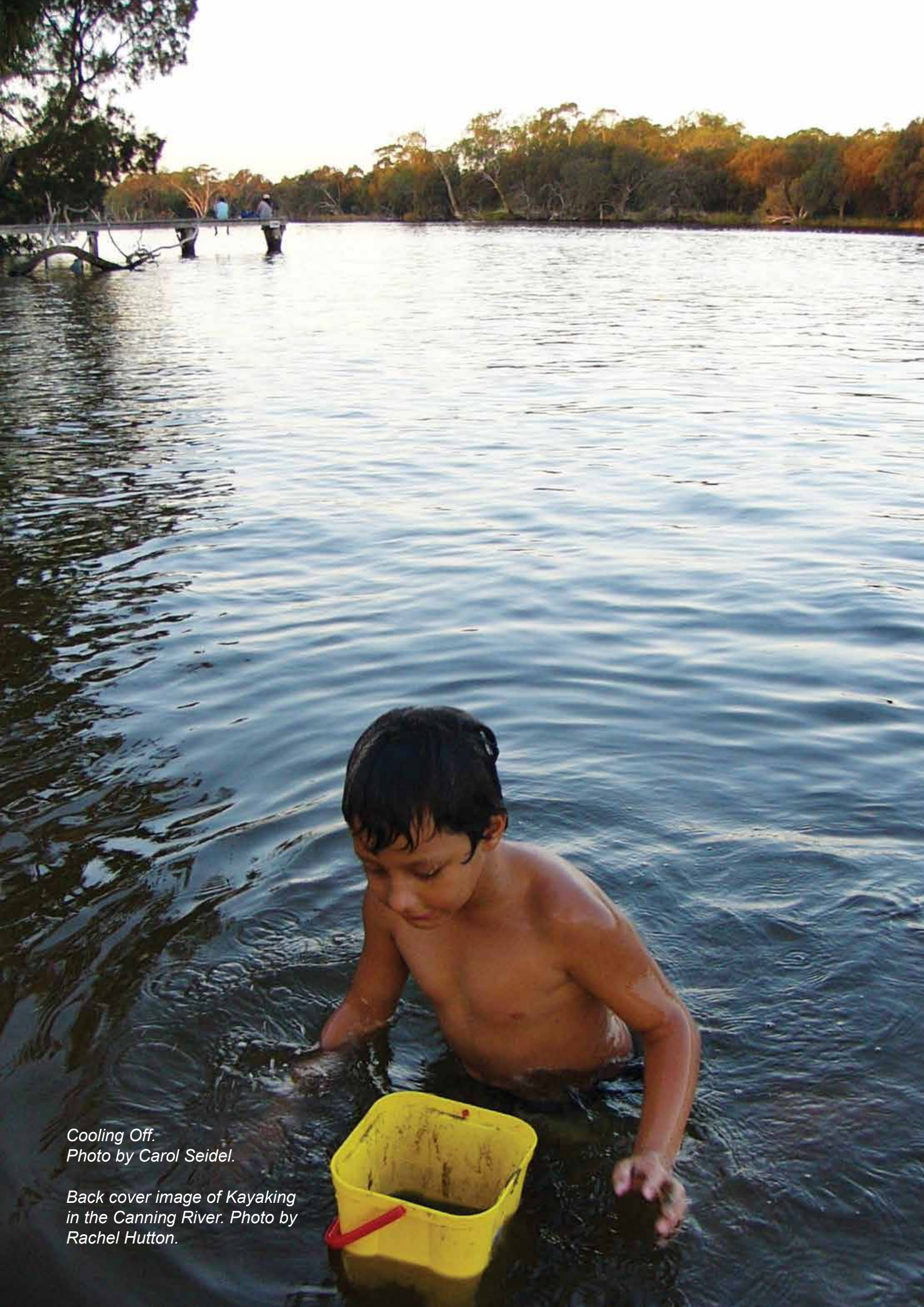
Cooling Off.