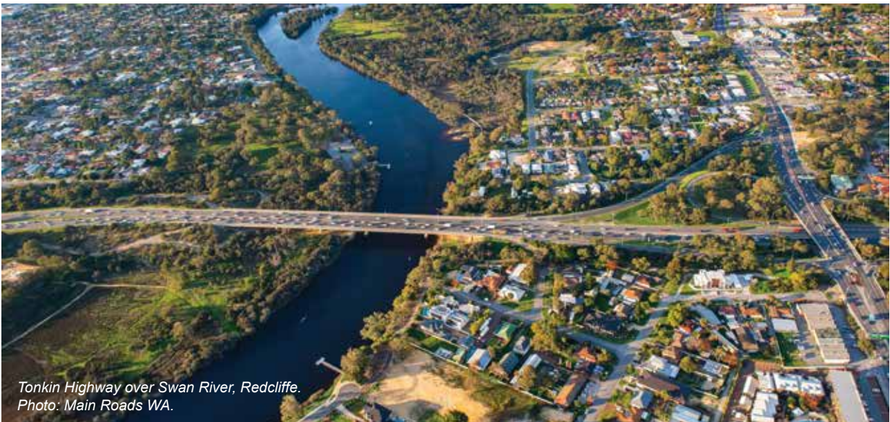
Tonkin Highway over Swan River, Redcliffe.

TGA has prepared management plans to ensure that adequate controls are in place to address environmental risks during construction works and is required to conduct regular water quality monitoring at the project site for the duration of the works. DBCA has attended regular site inspections with the TGA team and MRWA which have committed to undertaking foreshore enhancement and activation works as part of the Tonkin Gap project.