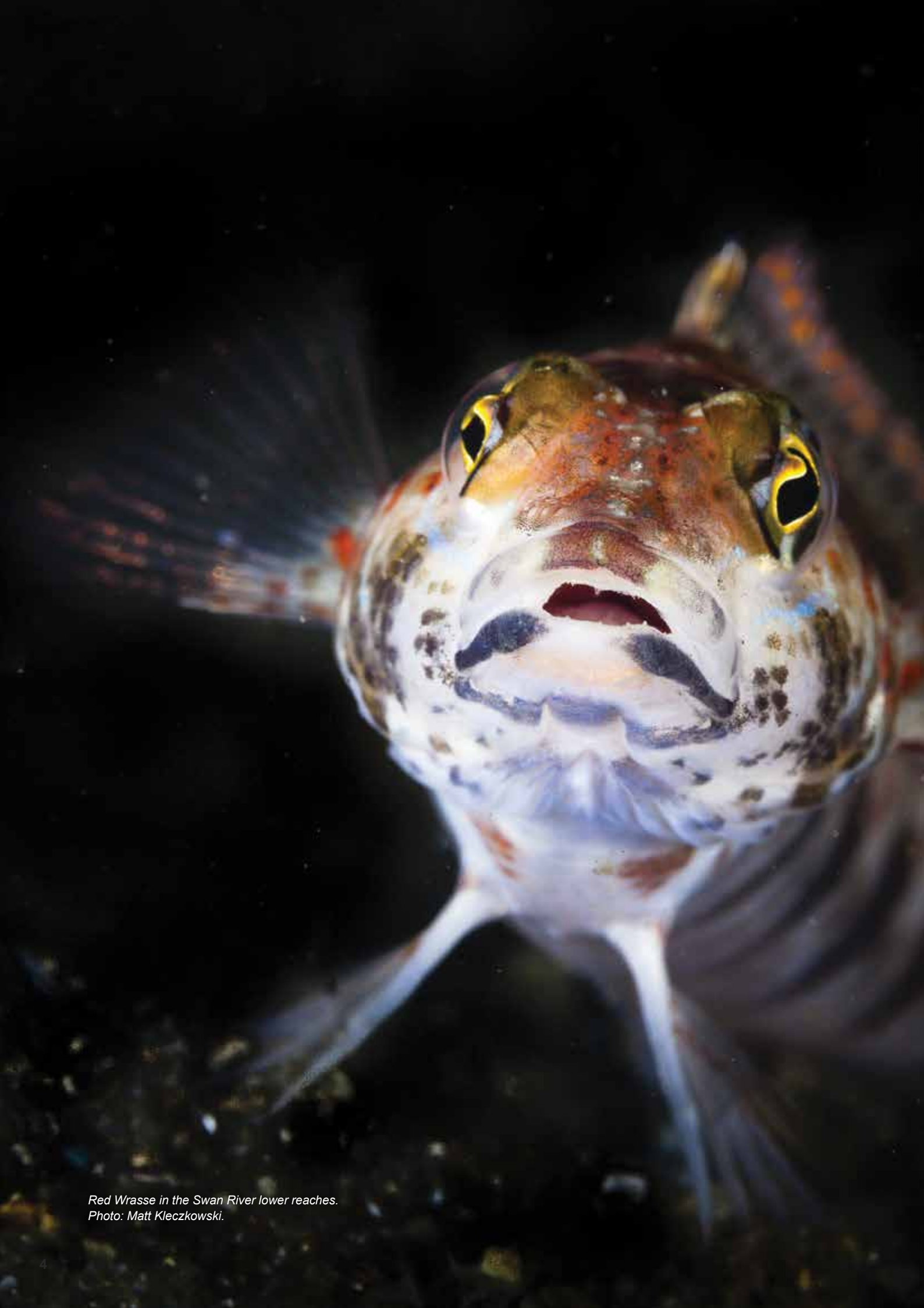
Red Wrasse in the Swan River lower reaches.