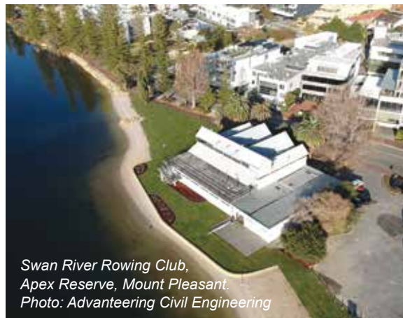
Swan River Rowing Club, Apex Reserve, Mount Pleasant.

During 2020-21, DBCA's Rivers and Estuaries Branch officers assessed and provided advice on 184 development applications on behalf of the Trust in accordance with the MRS.