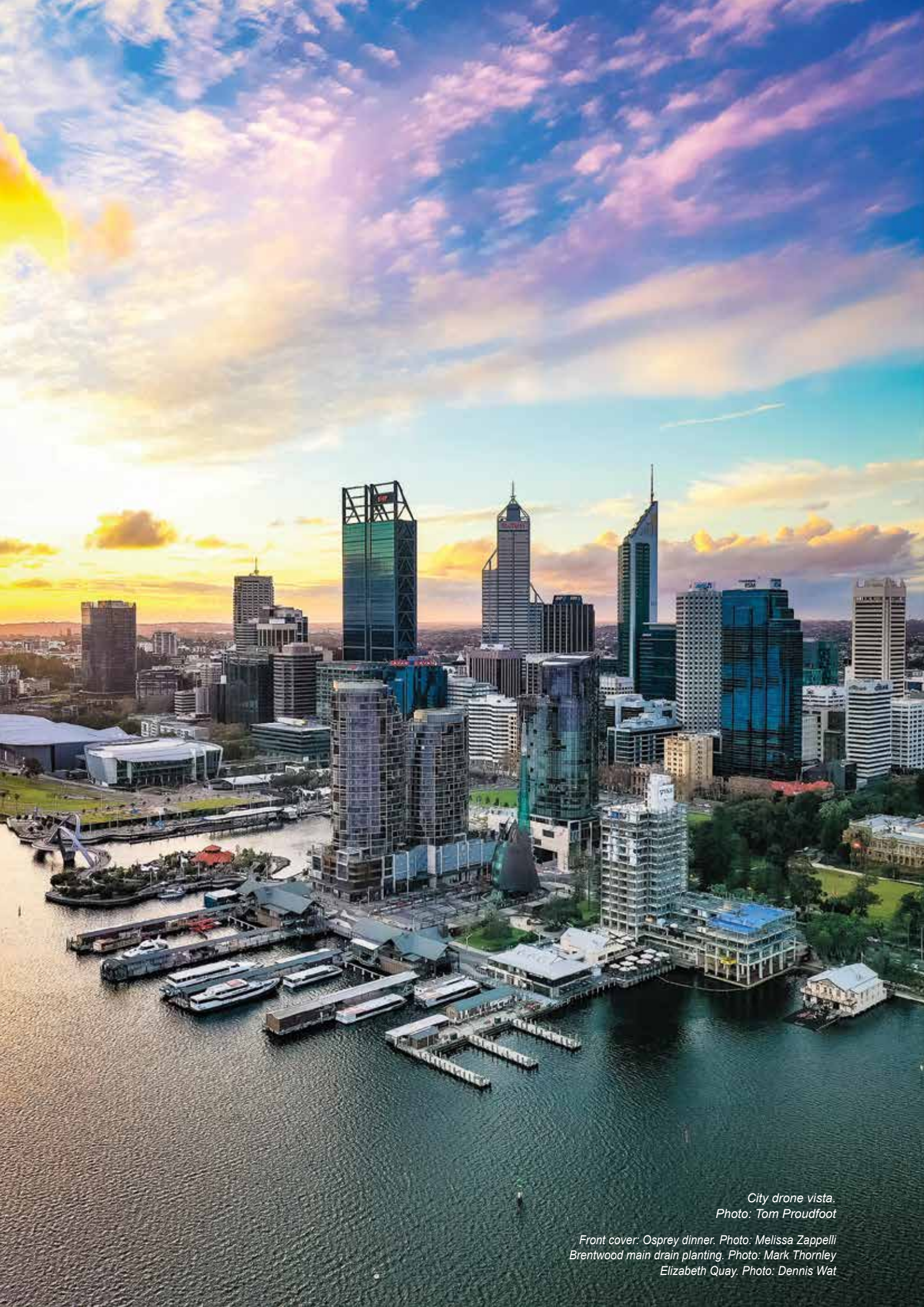
City drone vista.