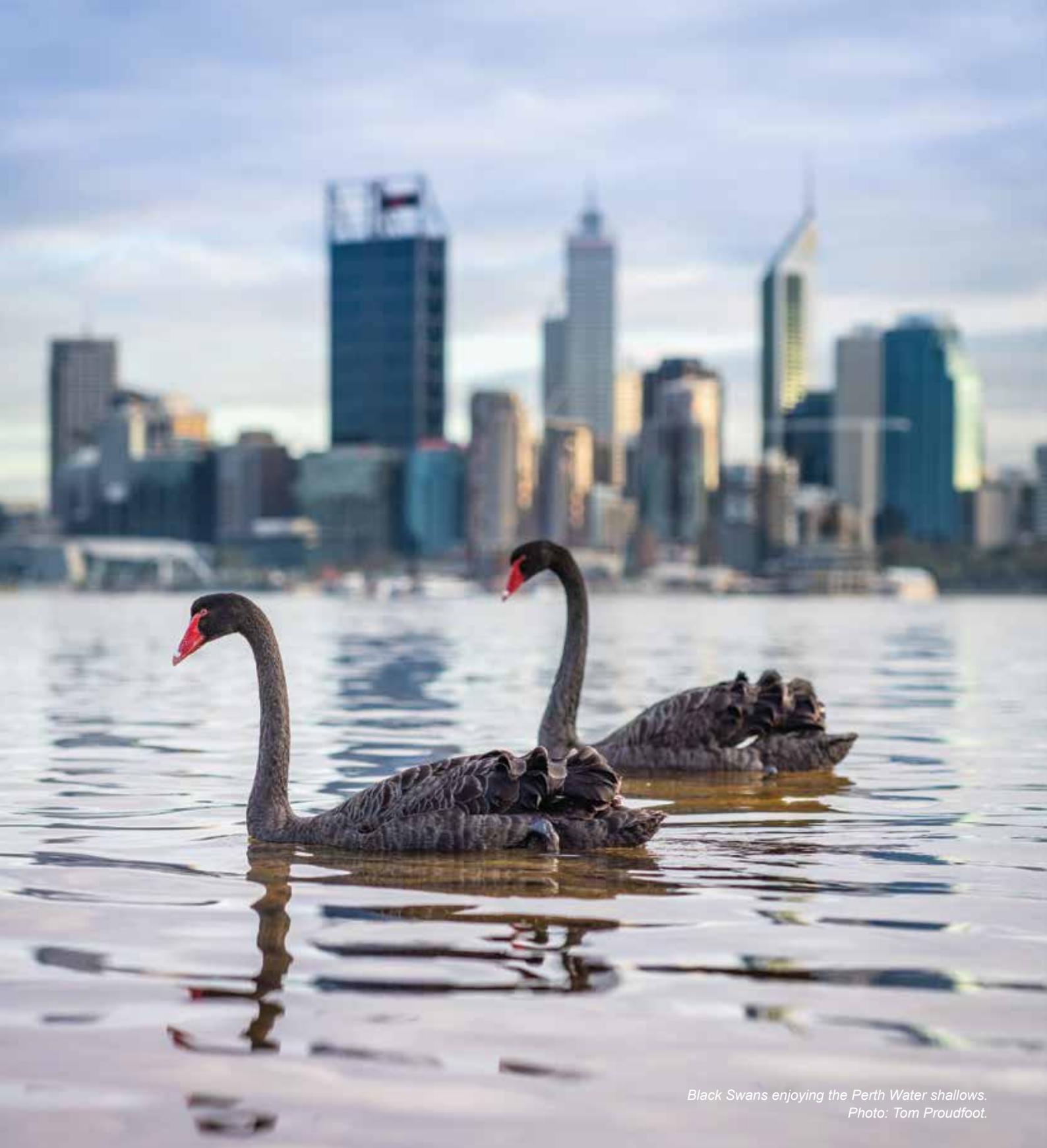
Black Swans enjoying the Perth Water shallows.