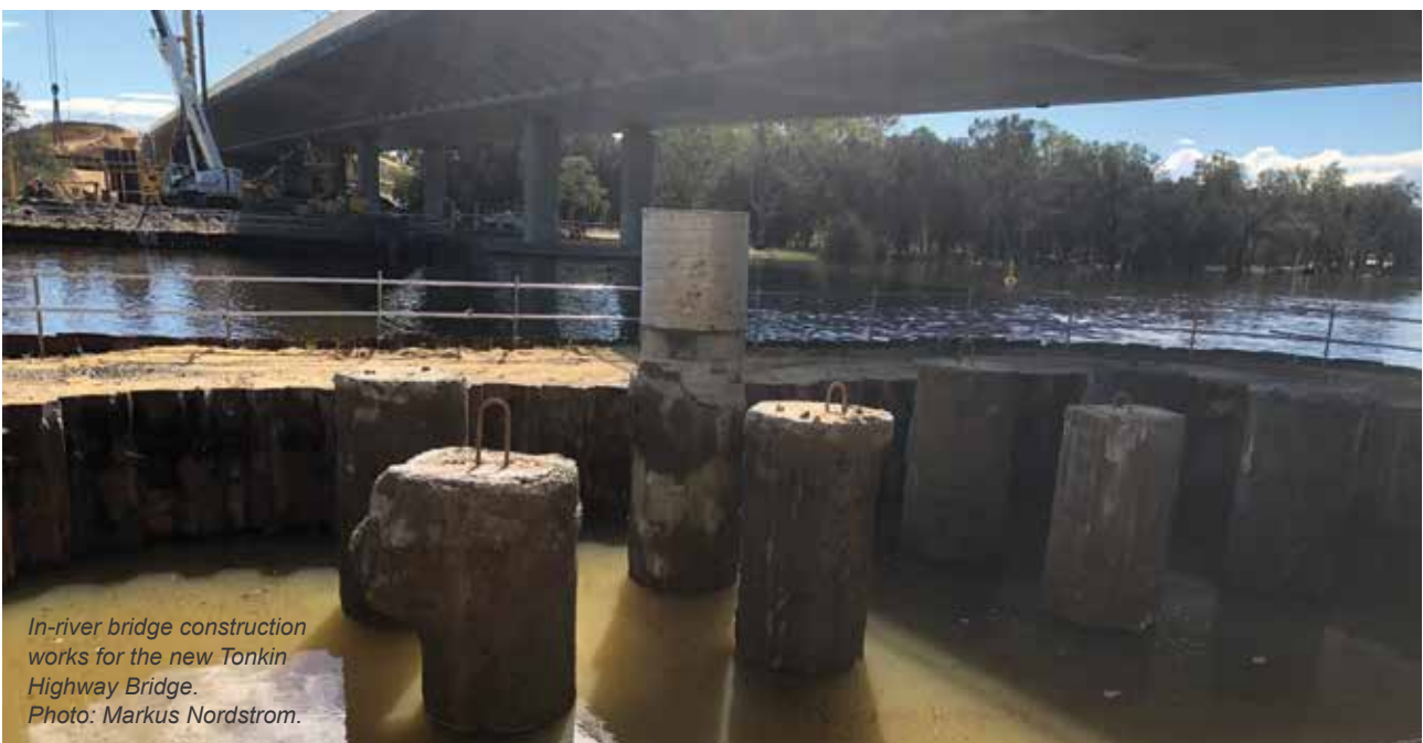
In-river bridge construction works for the new Tonkin Highway Bridge.