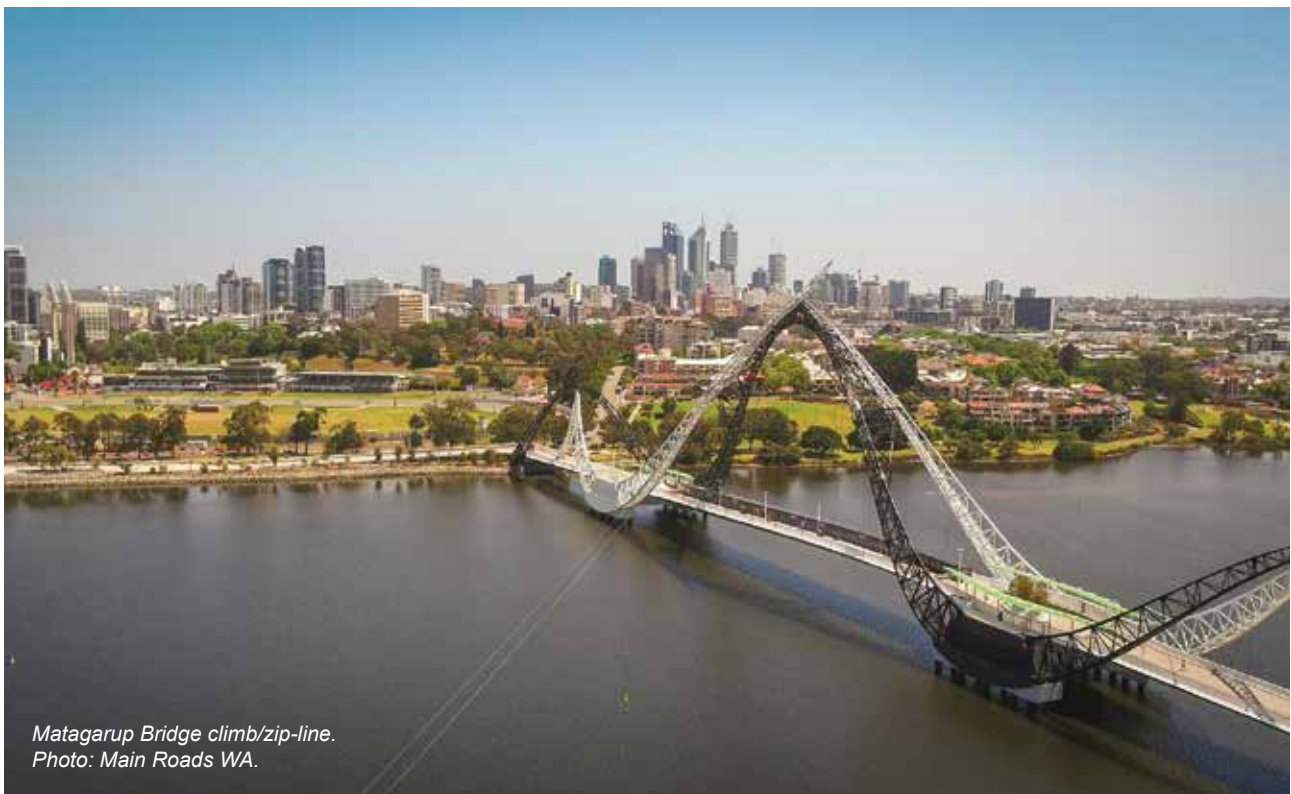
Matagarup Bridge climb/zip-line.

Use of Matagarup Bridge for tourism initiatives, including a bridge climb and zip-line, has been supported and facilitated by the Trust. The bridge was excised from the River reserve, which enabled the bridge tenure to be transferred to Main Roads Western Australia (MRWA) for ongoing management and operation of the zip-line subject to a variety of environmental and amenity conditions.