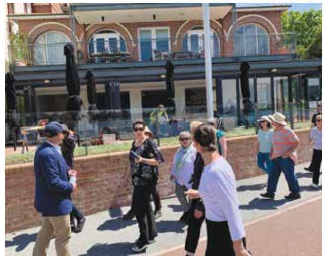
The Trust Board received briefings on the development issues associated with the East Perth Power Station, Sunset Heritage Precinct and Old Swan Brewery sites.