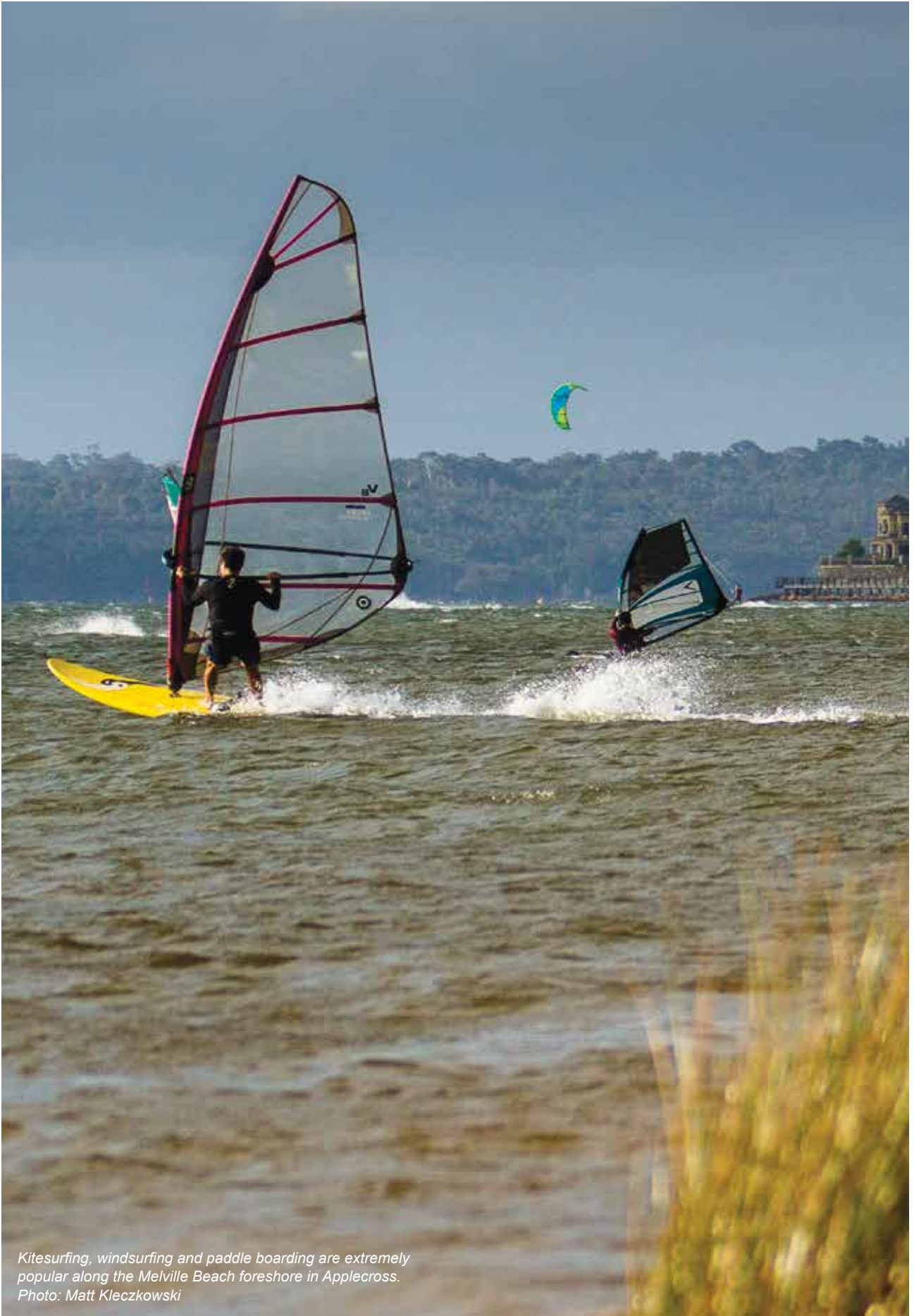
Kitesurfing, windsurfing and paddle boarding are extremely popular along the Melville Beach foreshore in Applecross.