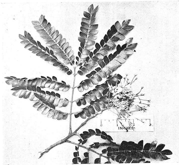
Albizzia gummiifera. Leaves and flowers.