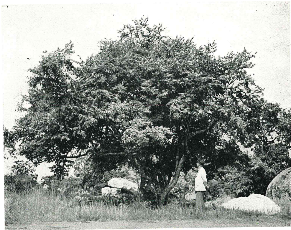
Grewia obliqua. Habit photo.