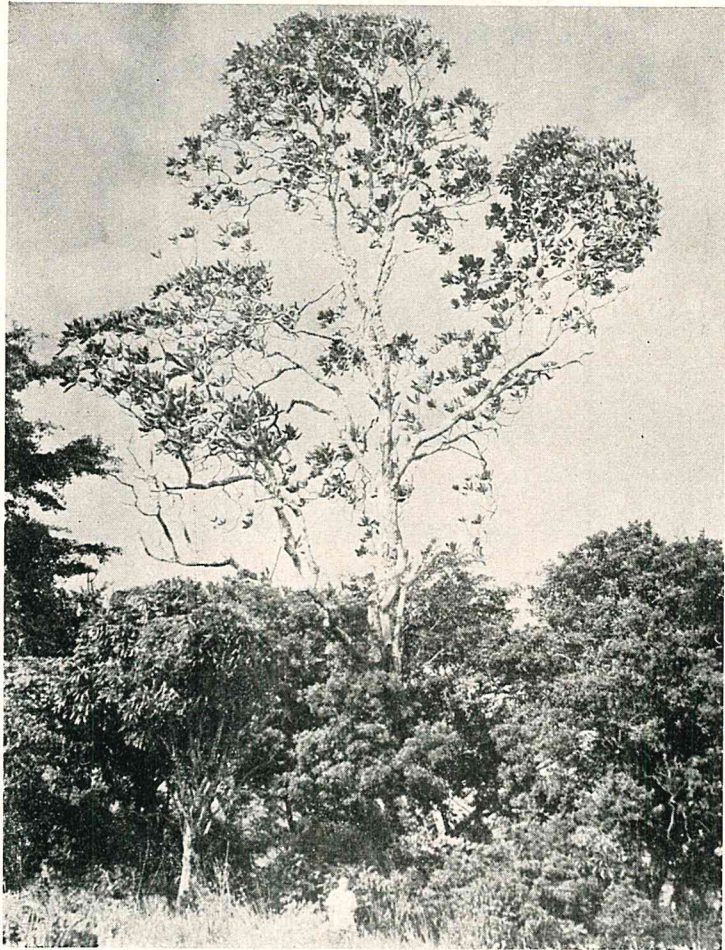
Anthocleista zambesiaca Habit photo