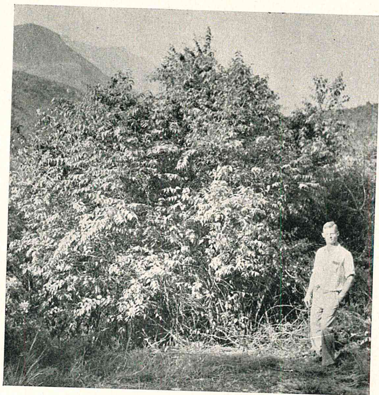
Halleria lucida. Habit photo.