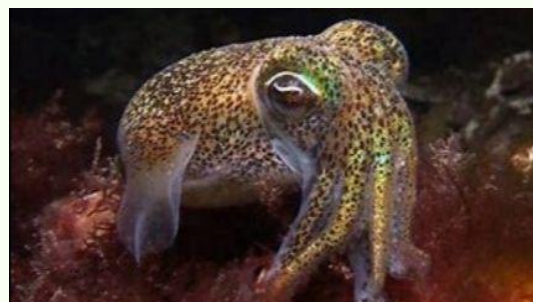
Southern dumpling squid.