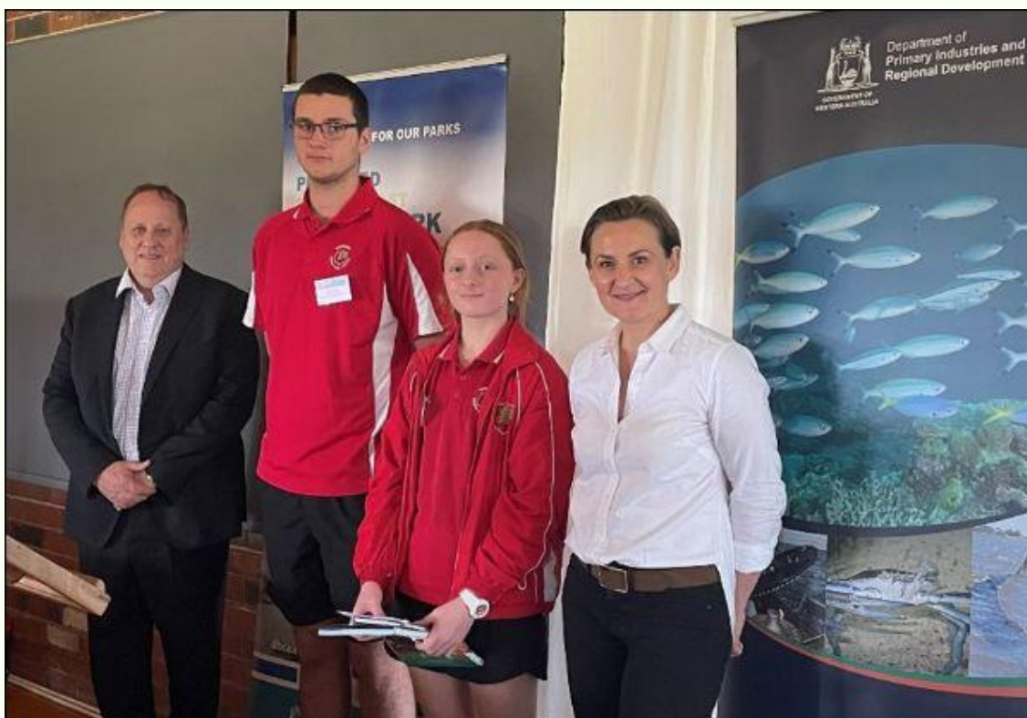
Ministers with Esperance Senior High School students.

Questions and answers from the Ministerial panel session (PDF 193KB)