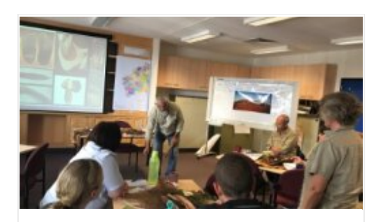
Aboriginal cultural awareness training (course registration)