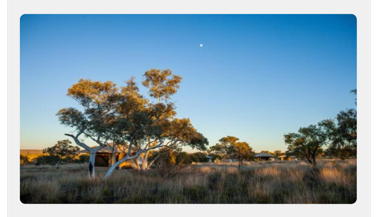
Tourism and concessions