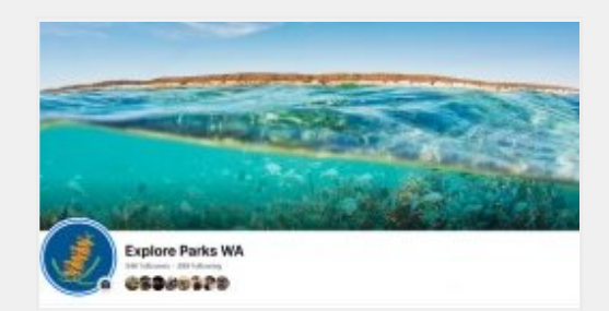
From social struggles to social stardom