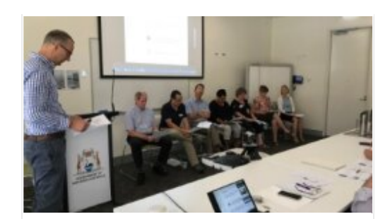
TBC - Introduction to legislation and regulations for PVS