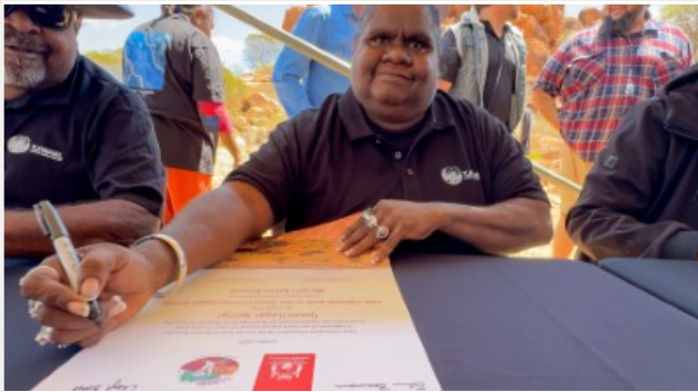
Completion of Tjiwarl Conservation Estate and first land handover of T