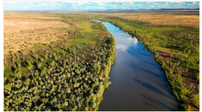
Governance Training for Joint Management Bodies