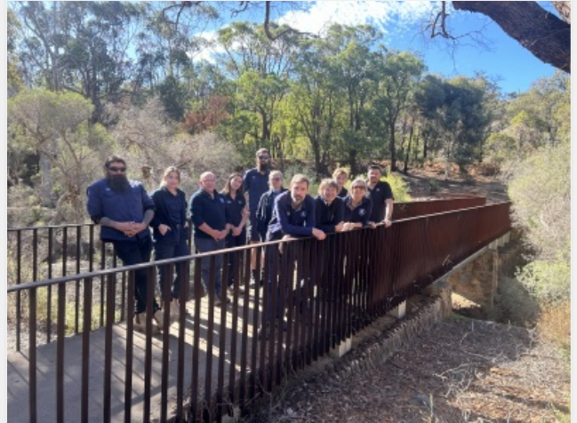
Sustainable trails training takes to the hills