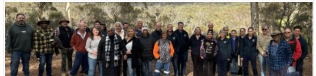
Important steps for the Ballardong Aboriginal Corporation