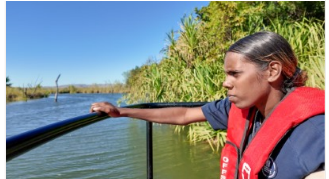
World Female Ranger Week at DBCA