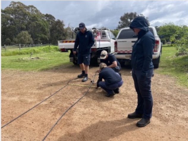
Visitor monitoring training days