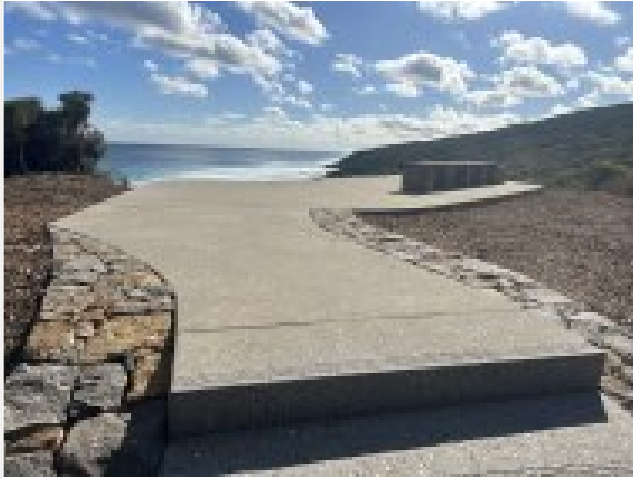
Rabbit Hill Lookout upgrade