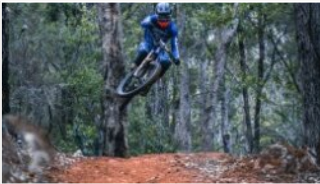
Wambenger Trails officially open