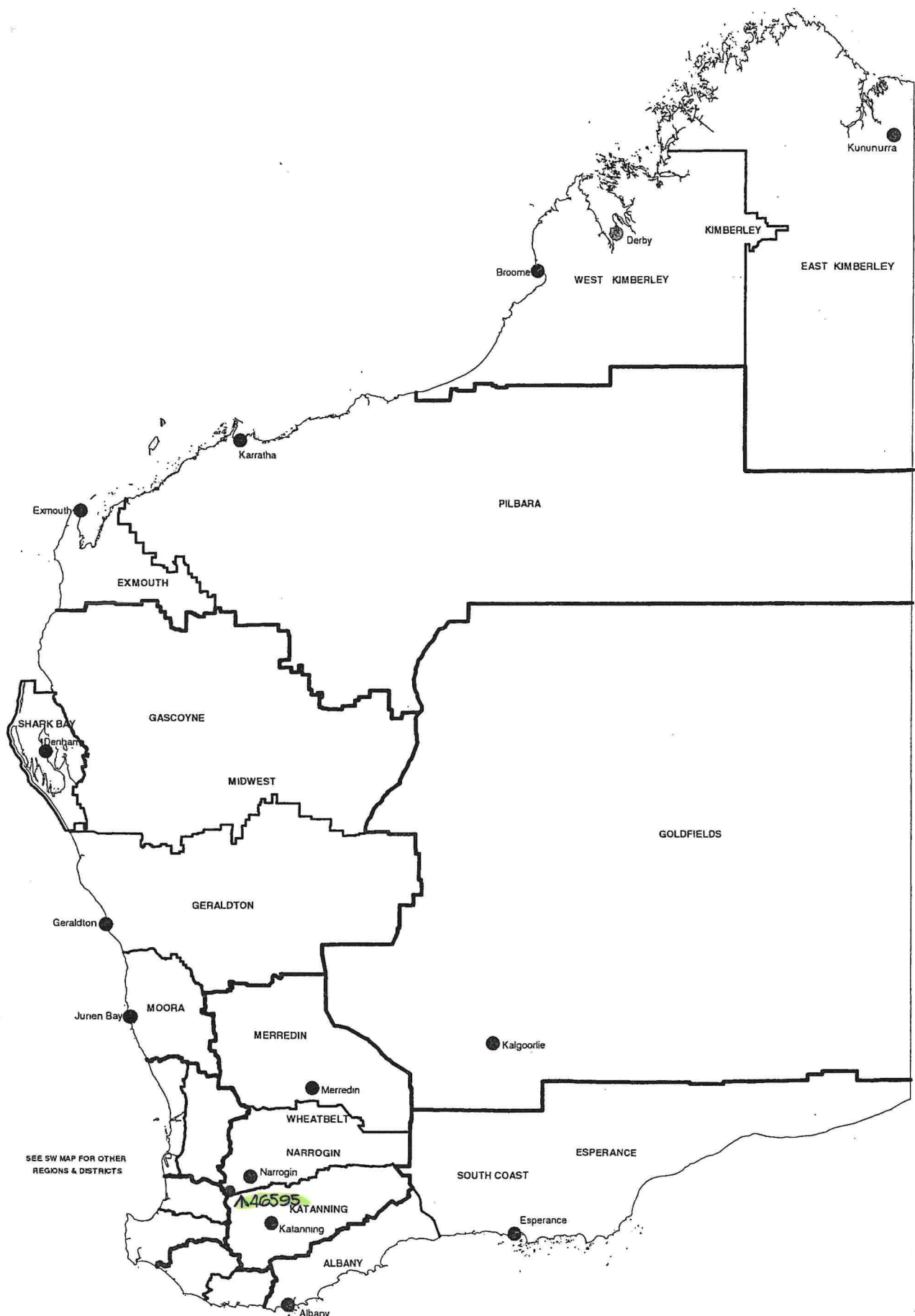
DEPARTMENT OF CONSERVATION AND LAND MANAGEMENT REGION AND DISTRICT BOUNDARIES OCTOBER 2001