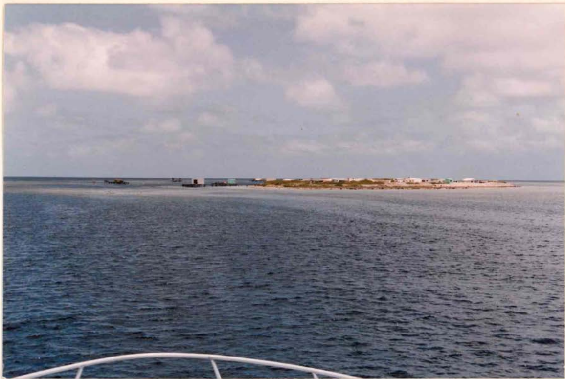
We camped on Burnett Island for the first week..