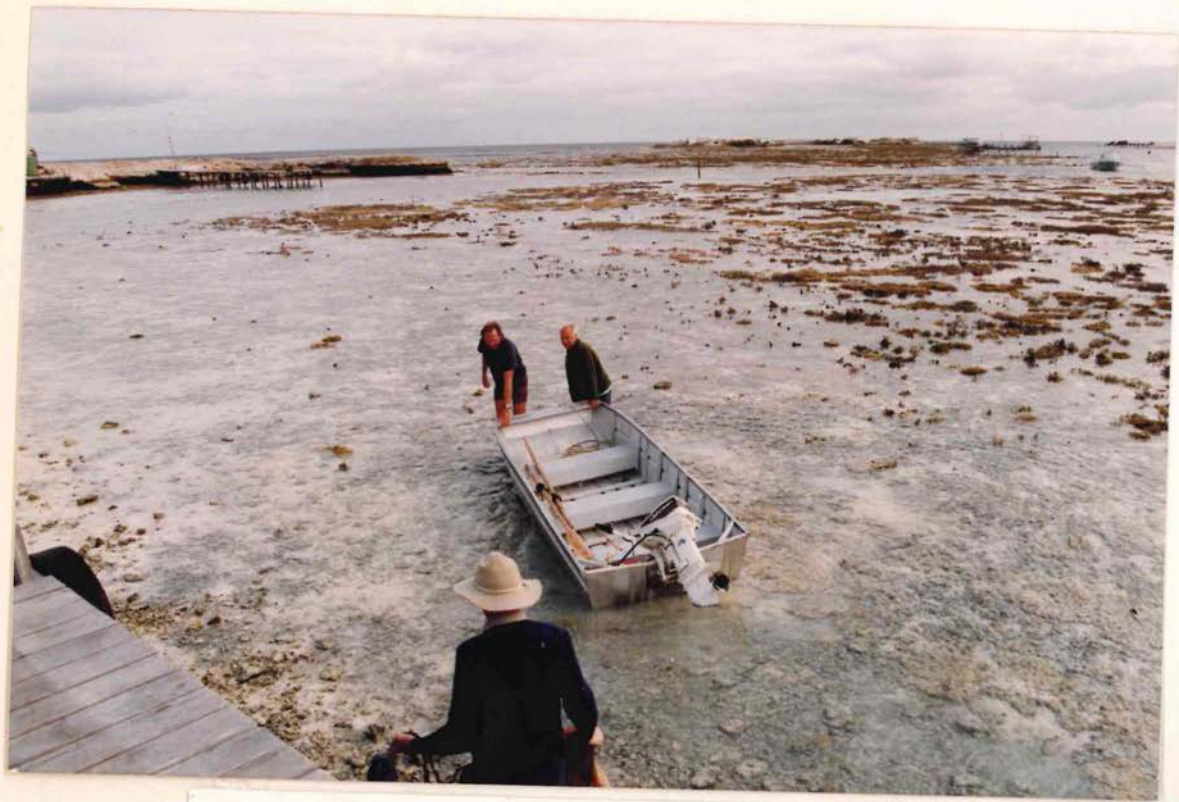
and carried the boat around a bit.