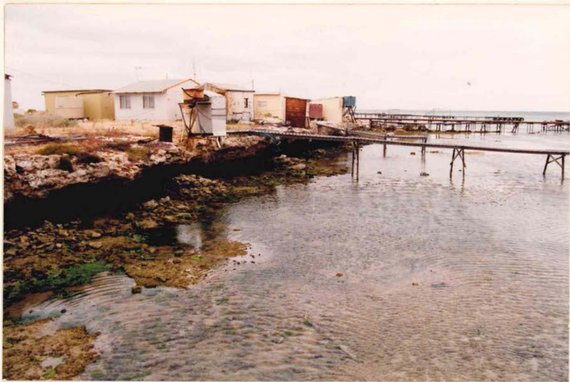
We then moved to Rat Island. Entertainment was scarce but...