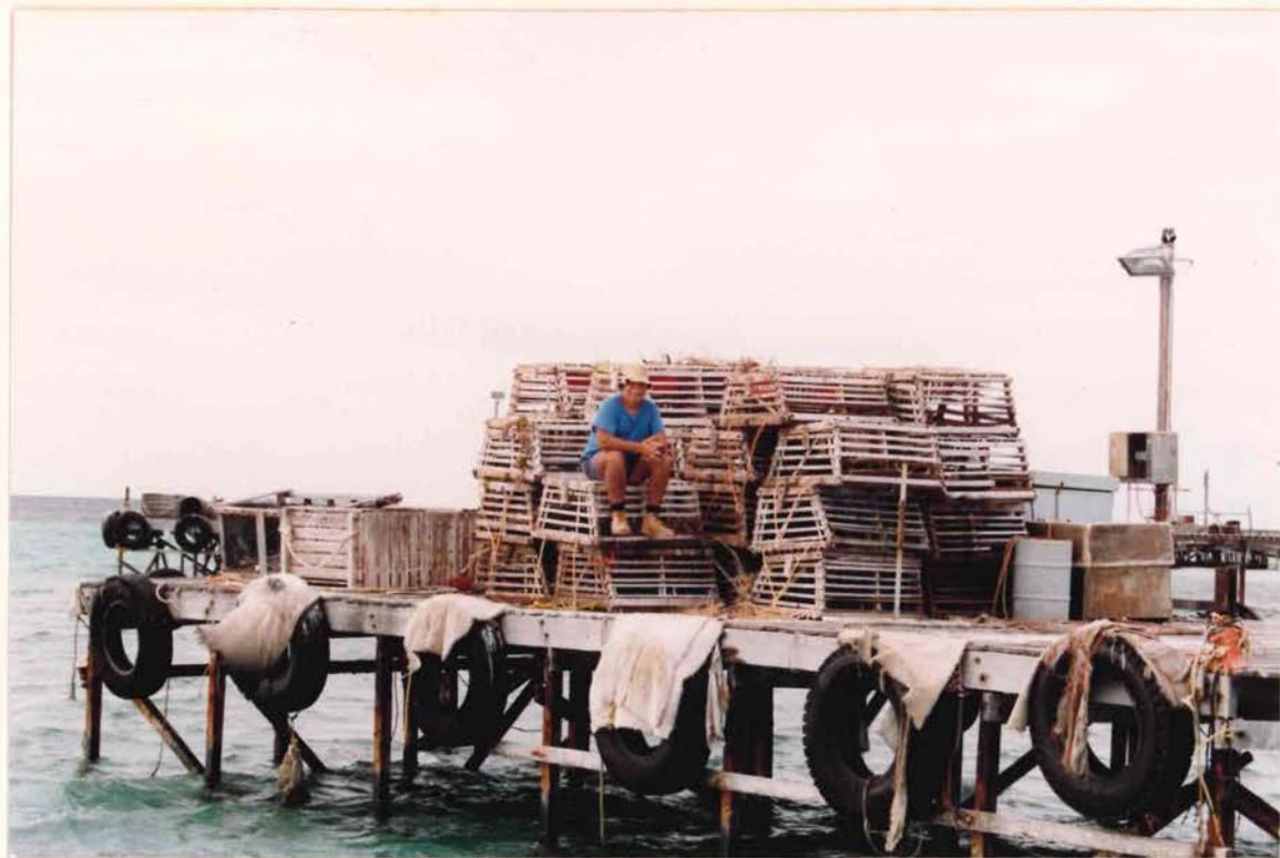
Phil waited for the lobster boats to come in...