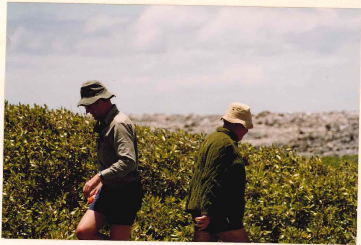
Arguments were settled with spray cans at 5 metres.