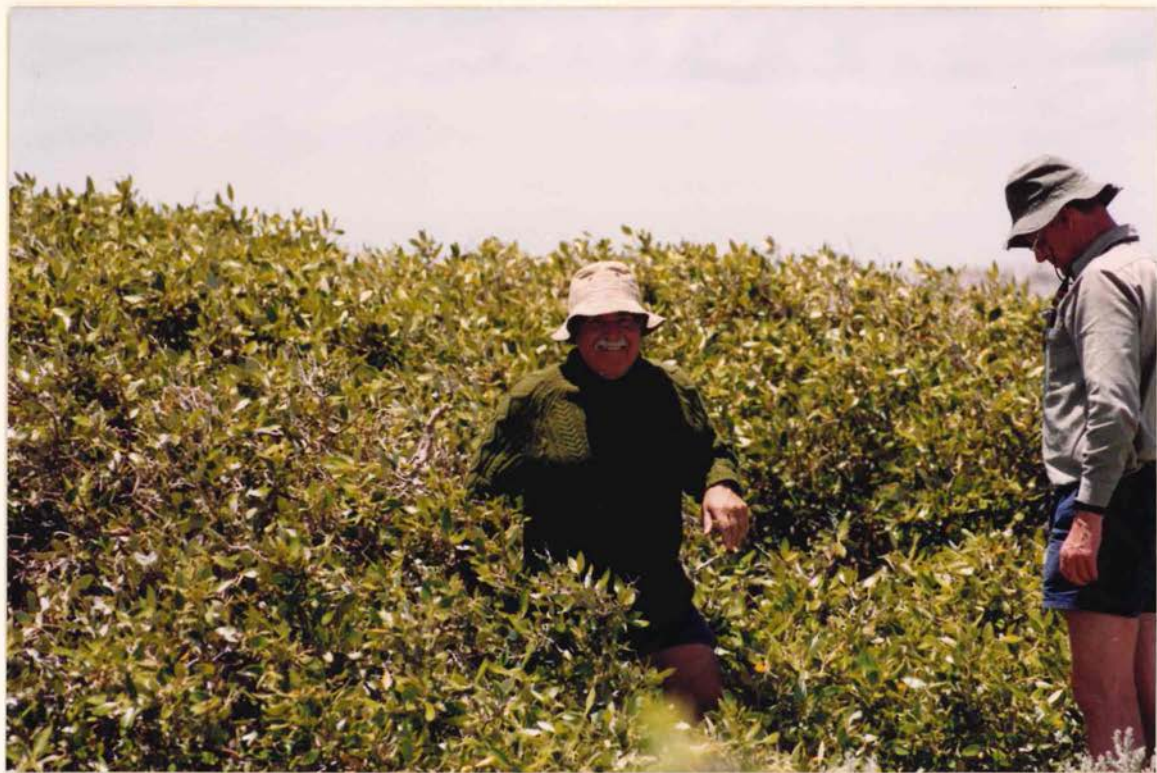
We counted Lesser Noddies in the mangroves.