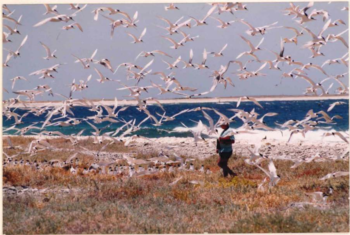
He found a remarkably large Crested Tern colony..