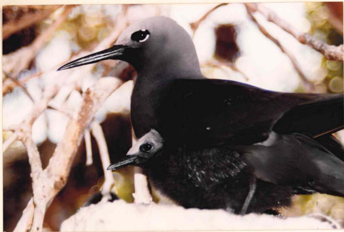
Others had well advanced young.