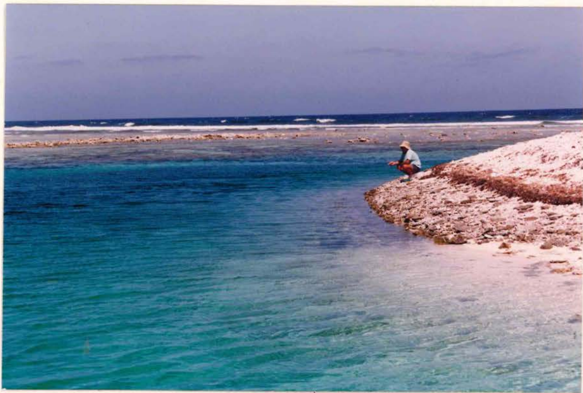
And Phil did some biological survey of the deeper pools.