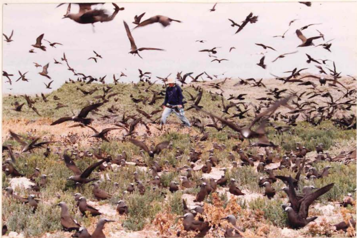
And the Common Noddies were thick too.