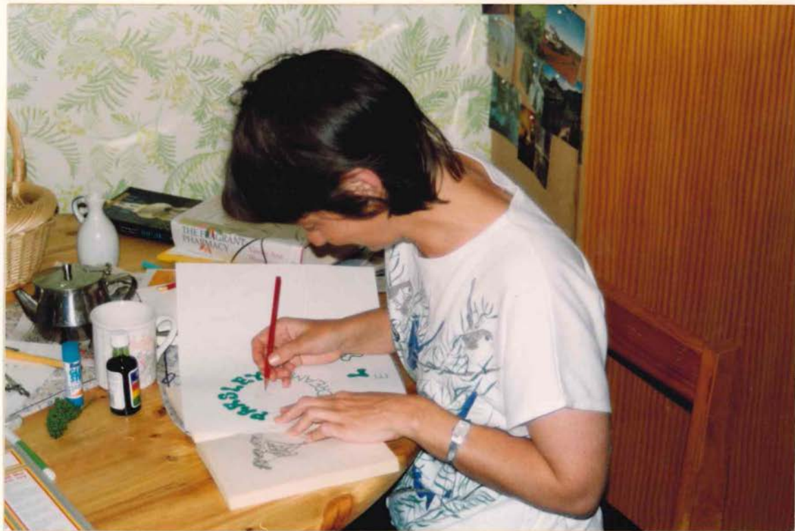
Wanneroo Graphics had arranged a customised label.