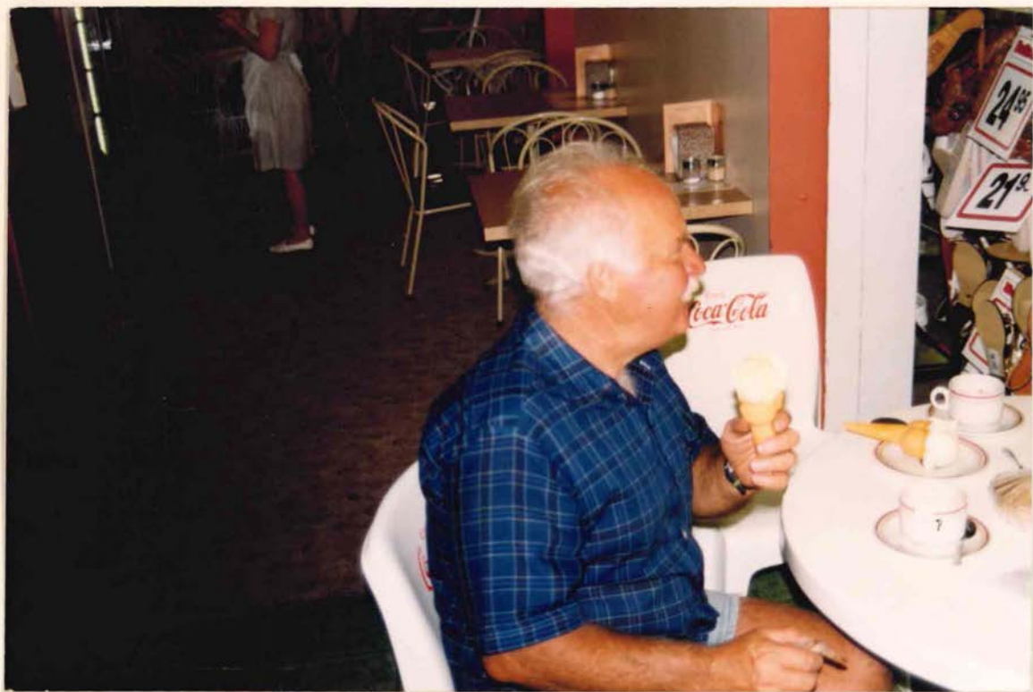
So we had a last double-header before departing.