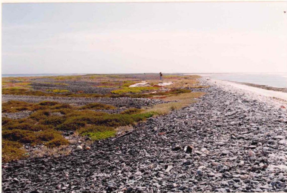
We surveyed nesting sea-birds on Pelsaert Island.