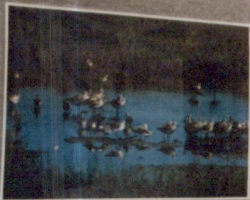
Seabirds on the beach