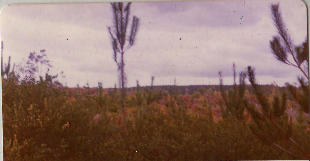
Private Forestry "Burnbank" area in background shown as unsuitable - "shallow rocky in Soil Survey JCG 24/10 - planted & died out 76/77 summer.