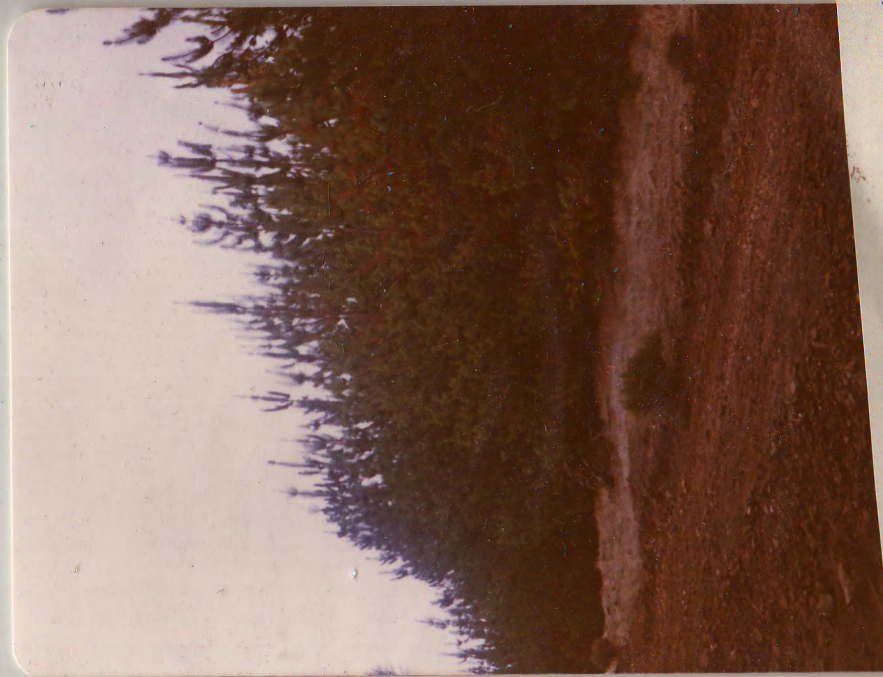
Private Forestry. Survey ALC 60/10) Drought wilt (S. Survey ALC 60/10) Most trees will recover.