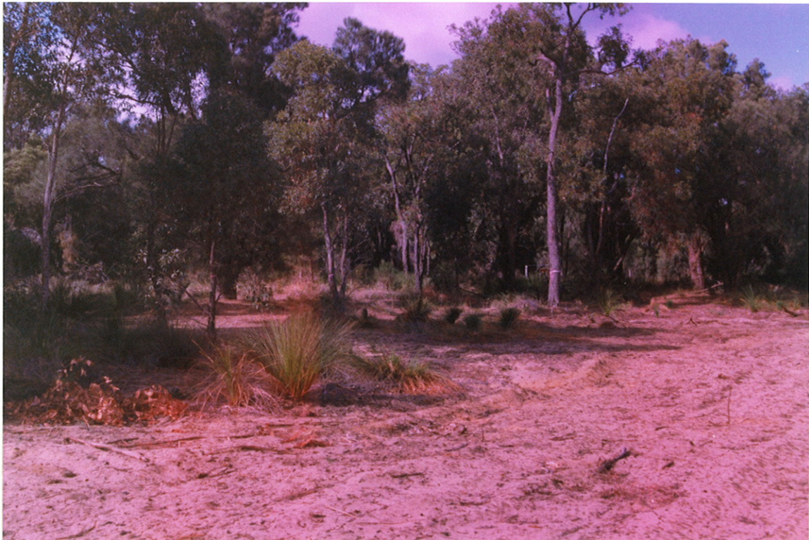
AREA FOR COVENANT AND REQUIRING FENCING & REHABILITATION.