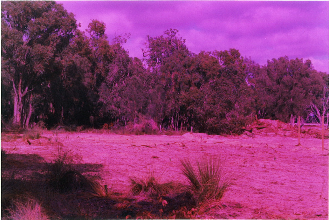
LOT 99 SOUTH WEST HIGHWAY (BPS 71) SITE OF PROPOSED WHOLESALE NURSERY ON CONDITION COVENANT PUT ON BUSHPLAN SITE TO PROTECT VEGETATION. 14 MAY 1999