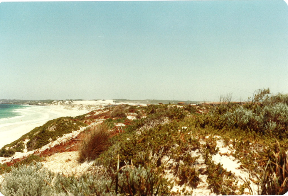
1. WHITFORD DUNES LOOKING NORTH TO MULLALOO FROM MERRIFIELD PLACE 10/12/81