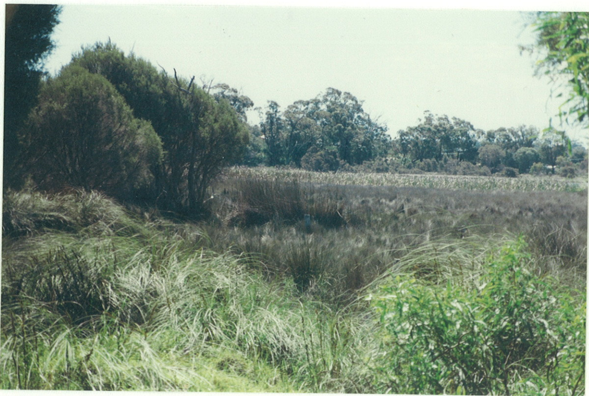
(162) Lake Josephine , Myalup 29-9-95