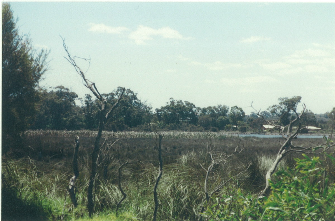
(162) Lake Josephine , Myalup 29-9-95