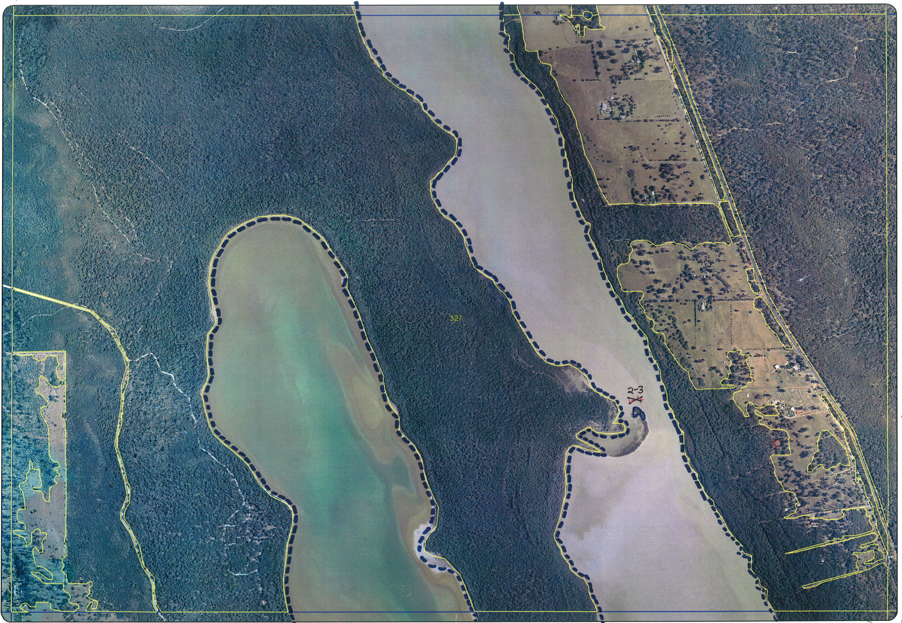
Bioplan Study Area Boundary